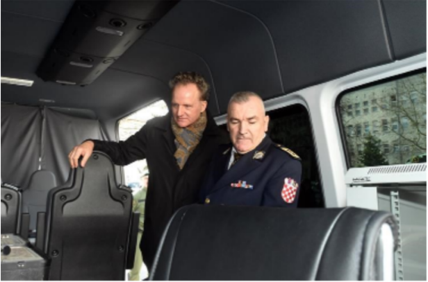
Mercedes Benz Sprinter donation to the Croatian Special Police

Concerning the issue of whether equipment donated to Croatia could be used in pushbacks, the answers received through FOIs and parliamentary questions were vague, again reassuring that all donations are gifted with a purpose-related contract, and lies within the sovereignty of the beneficiary state.<sup>52</sup> Responses further stated that any allegation of misuse of equipment or misconduct on the part of officers would be investigated by the beneficiary state, with the EU Commission monitoring compliance with European law. These responses we find somewhat lacking, given the documented failure of the Croatian state to implement a functional independent border monitoring mechanism, statements by the Ombudswoman and