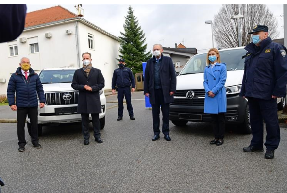
10 Toyota Landcruiser and 10 VW Transporters donated to Croatian Border Police by the German Federal Police