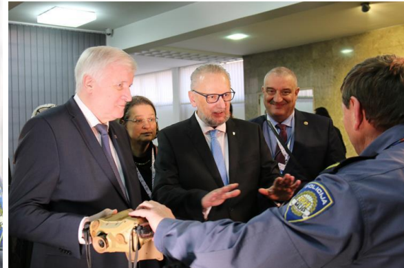
Thermal cameras donated to the Croatian Ministry of Interiors for the Border Police for use in border surveillance