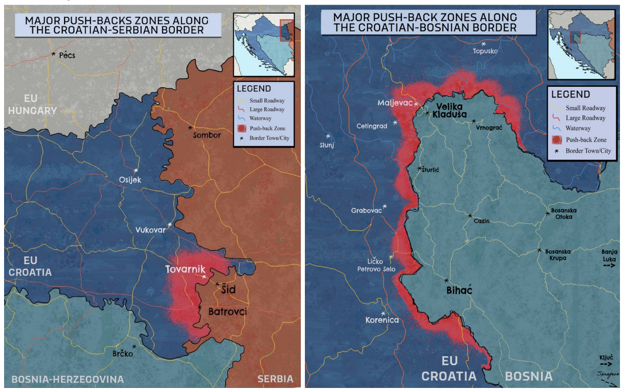
In 2019, BVMN published a large database of videos containing evidence of illegal pushbacks and rights violations along the Croatian border with Bosnia and Herzegovina.<sup>10</sup> In 2019, Swiss media outlet SRF published footage of Croatian authorities engaged in the process of a collective expulsion close to Gradina

The systematic practice of Croatian pushbacks have been further affirmed through the work of journalists, and national mechanisms such as the Croatian Ombudswoman,<sup>7</sup> and testimonies of whistleblowers.<sup>8</sup> In statements that later went public, police officers clearly described how they were ordered to "return everyone without papers, no traces, take money, break mobile phones or take for ourselves, and forcibly return refugees to Bosnia".<sup>9</sup>