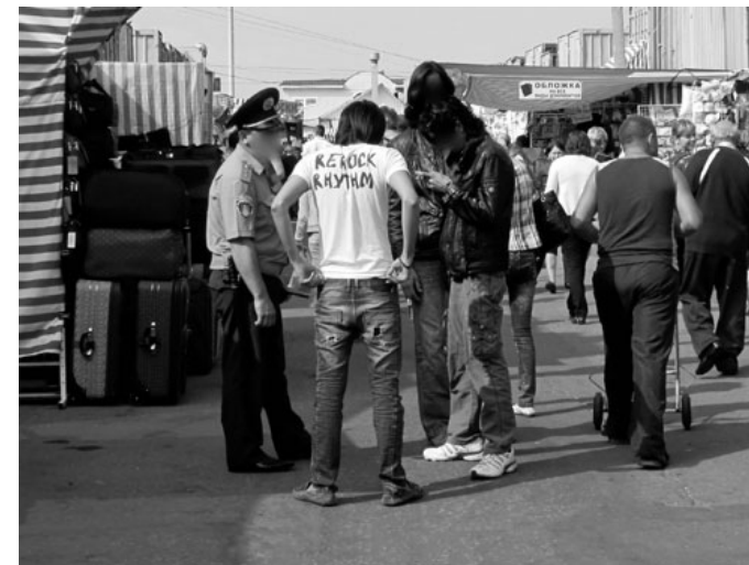
Passport control at 7th Kilometre market, Odessa

»On the market where I work ... there is private militia, they come and they ask me ›how much is shoes‹ and I tell them price, they say ›this is too much‹ and I give them the price I buy shoes for but they still say this is too much, and then I say