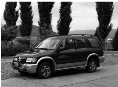
The type of cars driven by NGO staff raise asylum seekers' suspicion

Generally, also NGOs are looked at with considerable suspicion, for instance, an asylum seeker in Mukachevo believes that the local »XY [NGO] don't help people, ... [NGO] people think it is good business« and »that they set up their NGO for purely commercial reasons.« (8/2007) Even a scam was suspected involving the local refugee support NGO and UNHCR implementing partner and the local authorities, »Pavchino and [NGO]