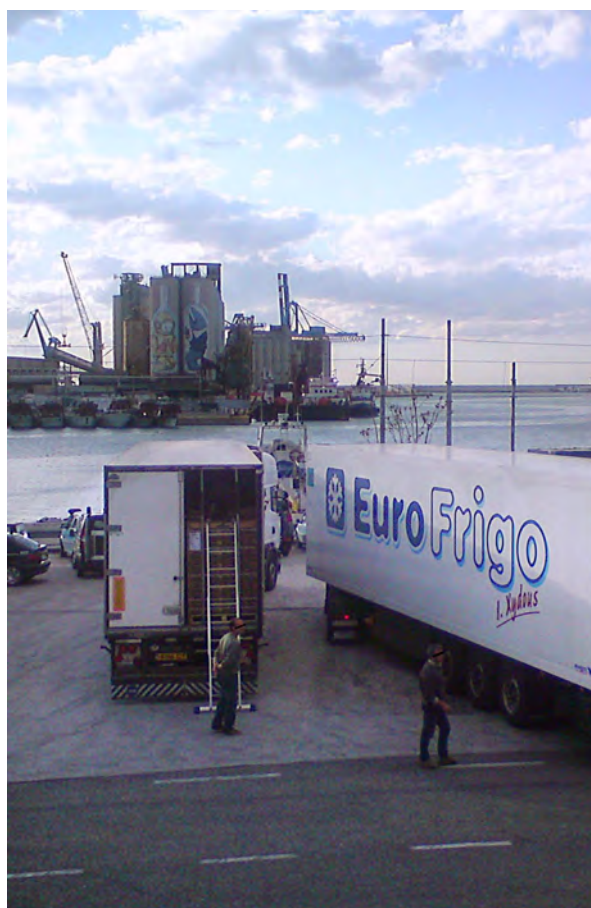
Control of trucks in the port of Ancona

cambiando il sistema dei respingimenti (Venice, 3.2.12) http://migromigra.apg23.org/2012/02/06/venezia-lettera-alla-coges-fuori-dal-porto-o-dentro-solo-cambiando-il-sistema-dei-respingimenti/