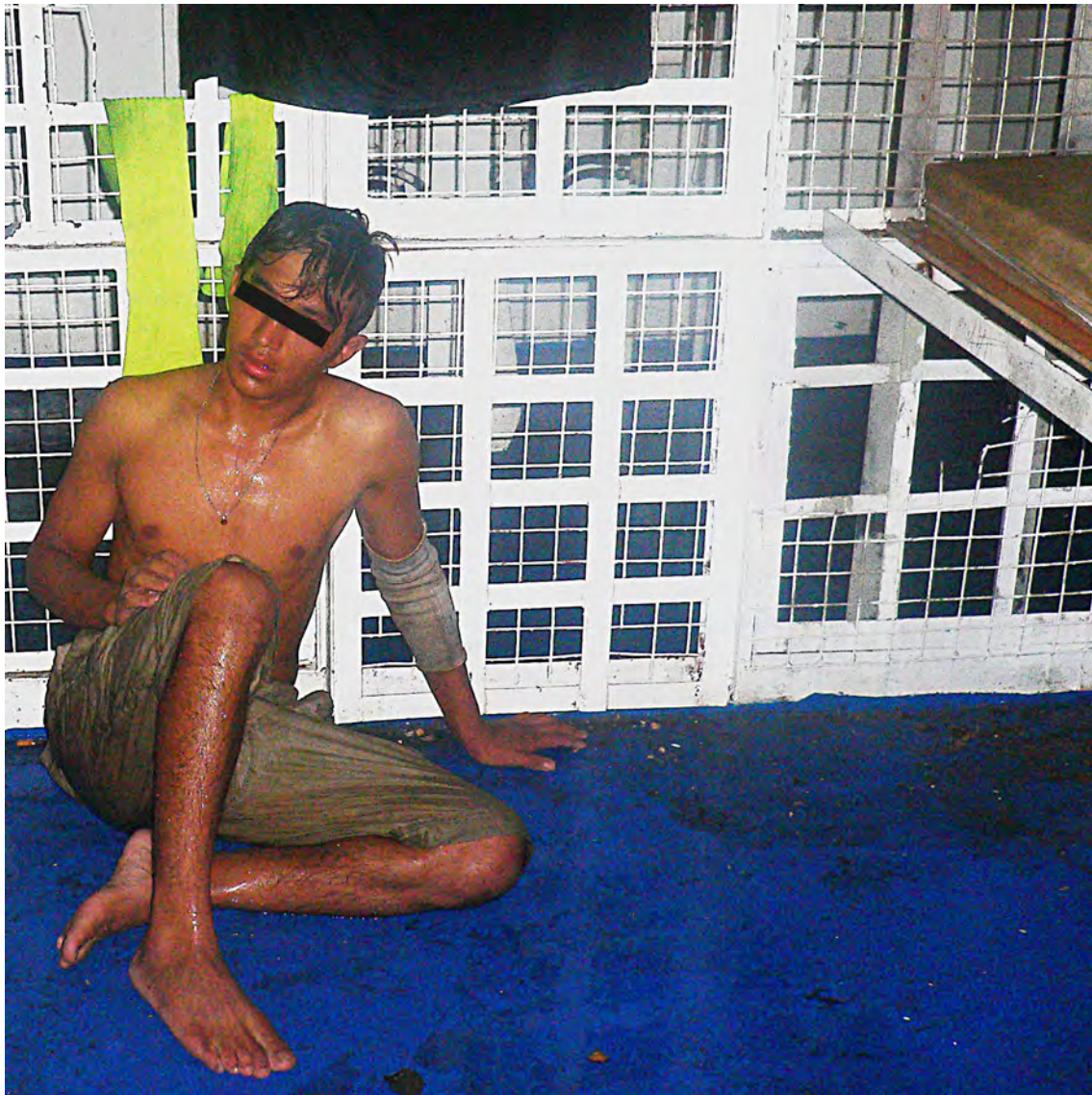
Readmission of unaccompanied minor