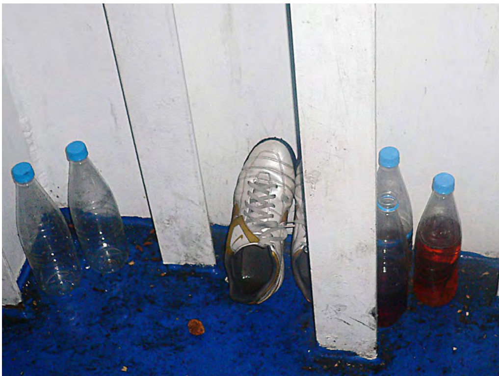
Lack of access to toilettes during readmission forces the people affected to urinate into bottles