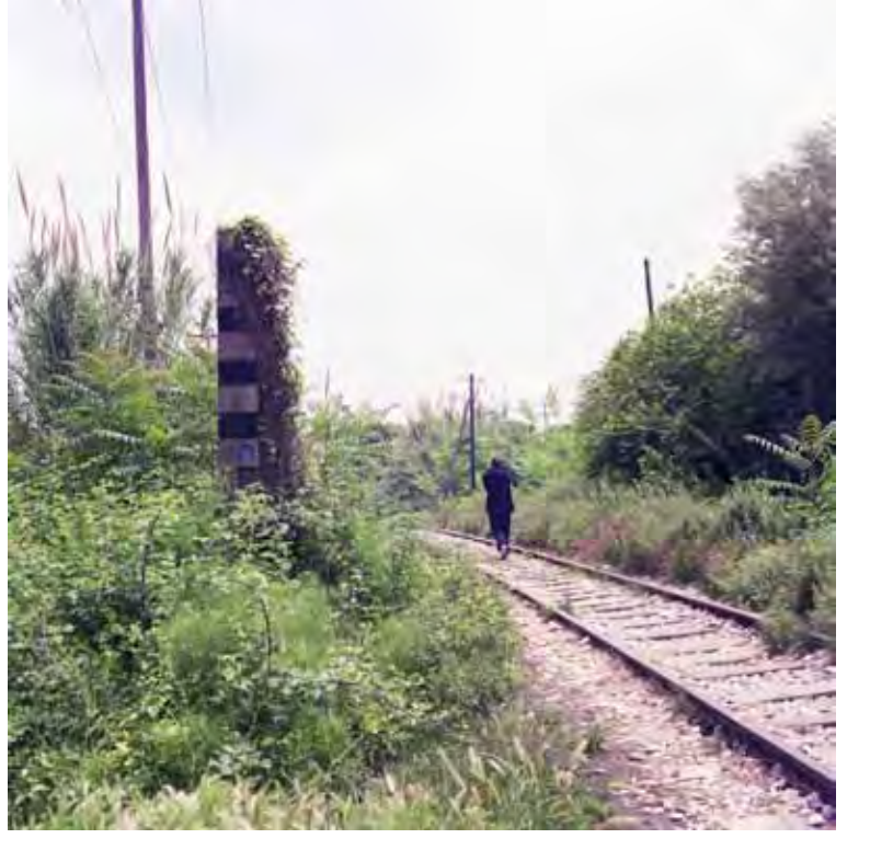
"Fear... fear... fear!