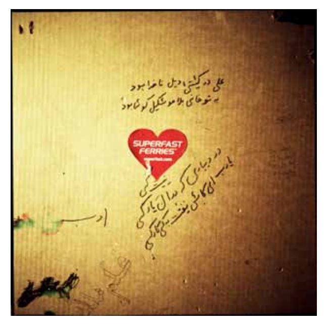
"In the place where no one remembers no one, you should not expect anything."

The police tell us: 'You want to stay here? Live like dogs and die like dogs!' We had heard that they would respect our rights here in Europe, but they do not know what the word "human" stands for. He points at a dog next to him. This dog is worth more than us to them. Common people do not really treat us bad, but the police do. Even though in our home countries we have so many problems, we never treat a foreigner bad. I believe Greece is the toilette of Europe!"