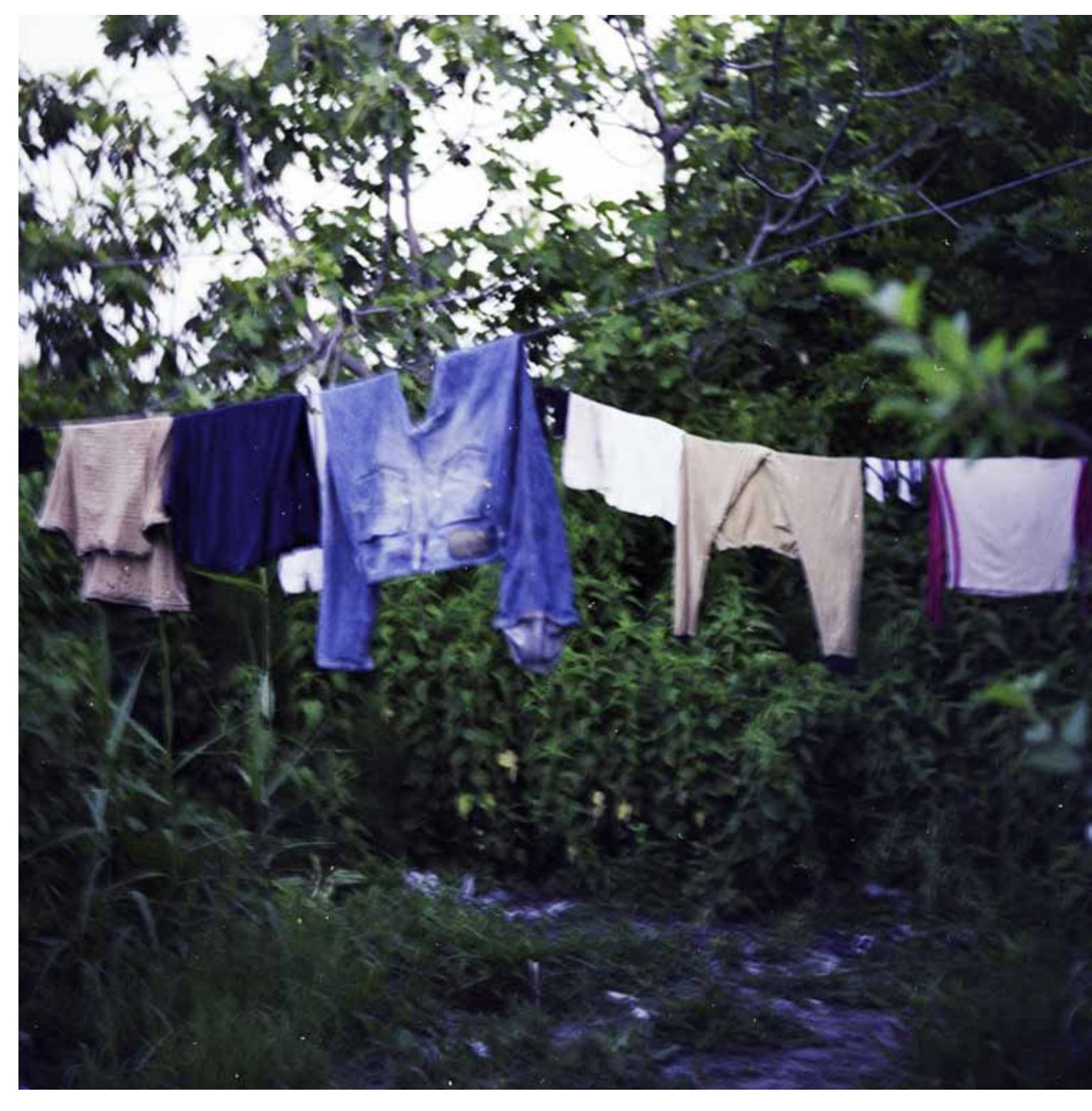
"Put yourself in my place. Imagine you eat from the garbage. What hopes would have you, if you were staying in Patras?"

One week ago, I was inside the new port along with two other persons. The "commandos" found us hiding under the truck. They pulled me out. There were six "commandos" and one dog. I was the first. They started beating me up. They handcuffed me and kept on beating me. They took off our shoes and threw them into the sea. They also took our mobile phones. We never got them back. They forced us to sit down. I was handcuffed behind my back. We were forced to lift our legs in the air and look upwards. They were shining their flashlights directly into our eyes, blinding us. Then they started beating us up again, while keeping insulting us. I have been beaten everywhere: in the head, in my stomach... everywhere. They were kicking us and beating us up with the batons. Next to me, close to my legs there was the dog. It was frightening. The most terrifying things in Patras for me are the dogs. Sometimes the "commandos" unleash them and send