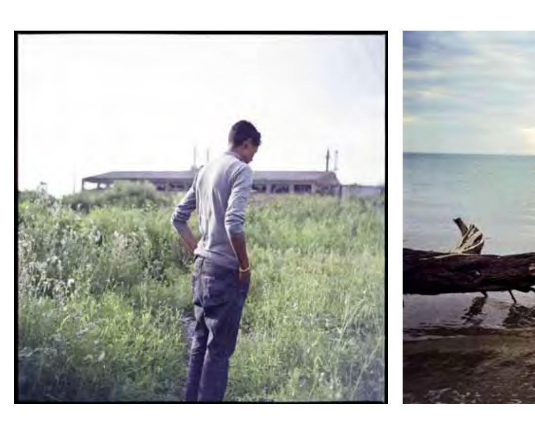
"Every night I am dreaming of leaving Greece!"

"In the beginning of March (2012) the "commandos" found me hiding close to the trucks waiting to embark on the ship. I was trying to hide under a truck along with a friend of mine. They caught us and handcuffed us. It was late midnight and dark. They ordered us to walk and the two "commandos" followed us on their motorcycle and started kicking us while in motion. They led us to the Check-In point. We stood next to a wall, where nobody could see us. A second motorcycle arrived with