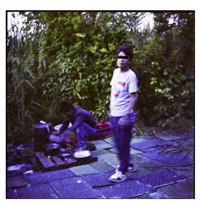
"We come from a country at war, in order to find peace and we find ourselves in the middle of violence."

"A month ago I was caught by the police near the port. I was close to the Lidl Supermarket. One officer handcuffed me and put one part of the cuff on the motorcycle. Then he officer started driving up and down for about 20-25 minutes in front of everybody. It was around 2pm."