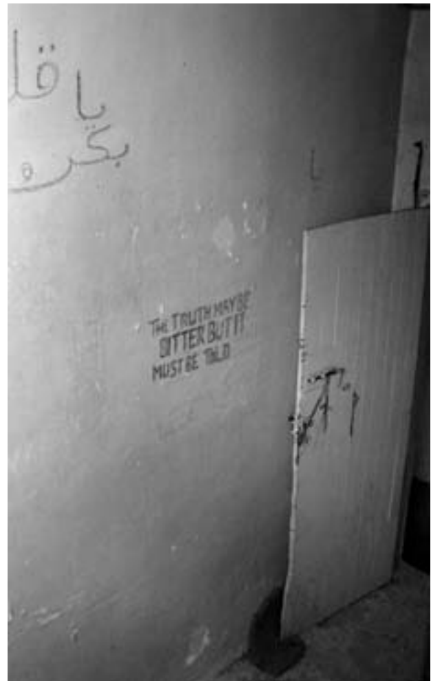
Wall inscription in the former detention centre on Lesbos

For these reasons, the construction of an asylum system in Greece and the European Union is essential. This system must be based on the principle of the absolute respect for human rights and asylum law, as proclaimed by the heads of state in Tampere in October 1999. If this is not the case, then Europe is jeopardising its achievements in human rights development – of which it is rightly proud – at its very own borders.