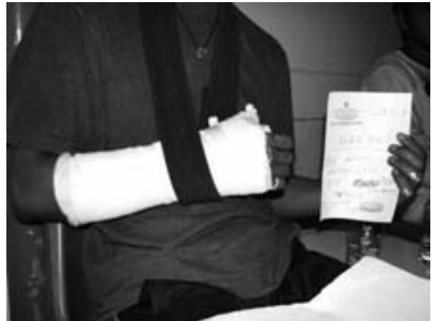
Patras: Afghan minor in hospital after severe ill-treatment