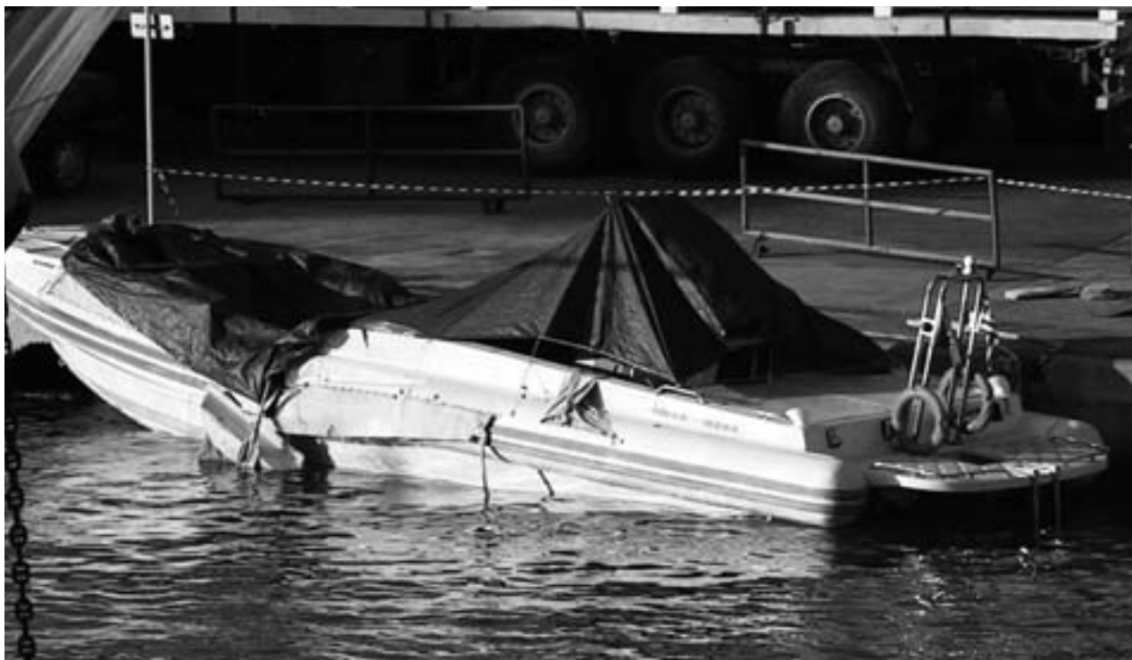
Chios: A boat mistakenly shot at by the coast guard, just near the coast.

Special units 12 , which do not operate under the usual civilian regional chains of command as the rest of the coast guard, are operational in the name of the coast guard. These units operate independently on self-assigned, often secret, missions. They take orders directly from the leadership of the coast guard's military section.