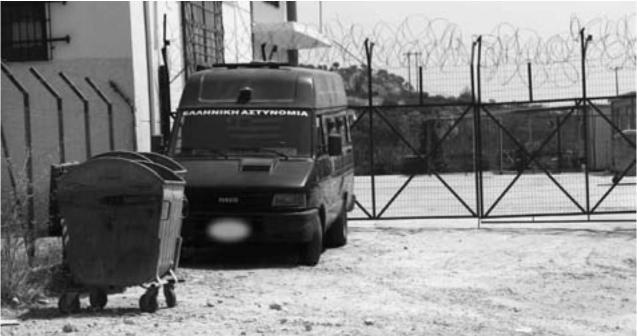
Lesbos: entrance to the detention centre