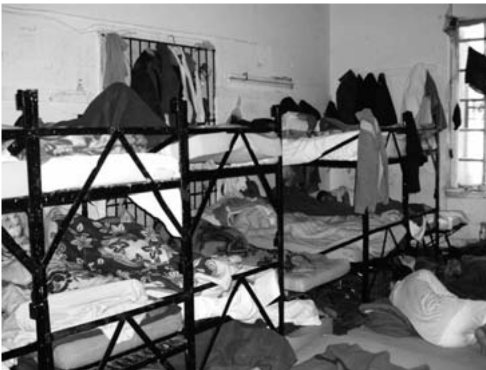
Samos: bedroom in the detention centre

We spoke to a Palestinian from Lebanon who had a broken rib as a result of mistreatment by the coast guard. At the time of our visit no examination in a hospital had been arranged, despite the fact that the affected person had been complaining about the pain and blood in his spittle for weeks. Only during the second day of the visit, could the delegation secure that the mistreated individual could be brought to hospital and treated – over two months after the injury was inflicted 34 . Refugees from Ethiopia and Algeria also report severe mistreatment during apprehension by the coast guard.