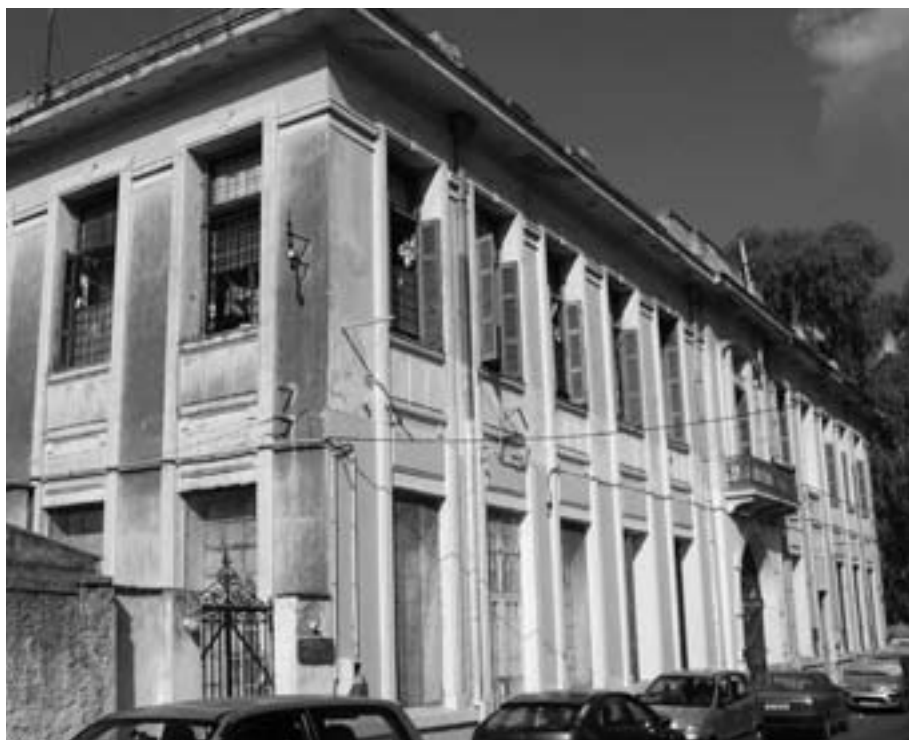
Detention centre Samos-City

The detention centre is in Samos City, in a former cigarette factory built in 1928. The building, which is in serious need of repairs, if not totally dilapidated, is in the middle of town.