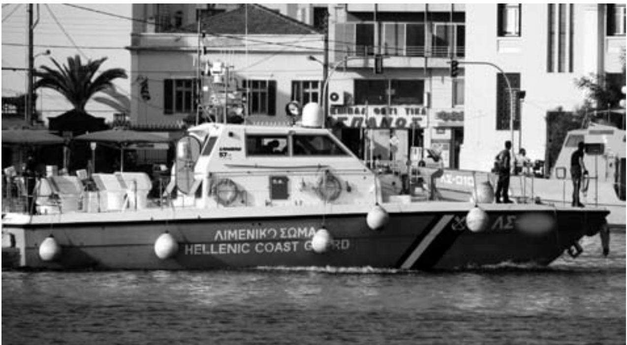
Boat of the Lesbos coast guard showing mount for a machinegun on its prow.

Even the head of the coast guard Mikromastoras confirms that, secretly, refugees are brought back to the Turkish coast, even after they have been on Greek