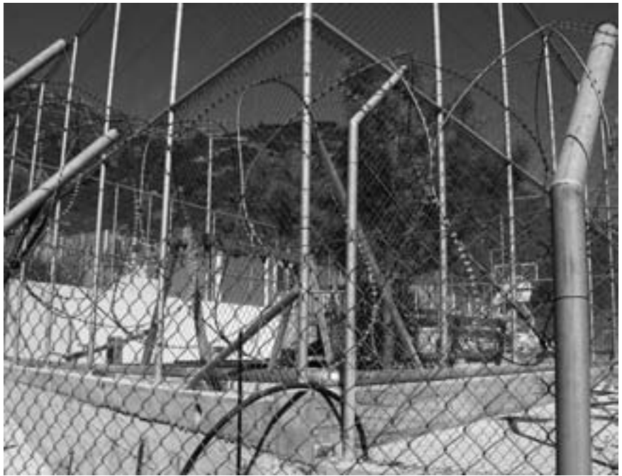
Samos: children's playground in the new detention centre