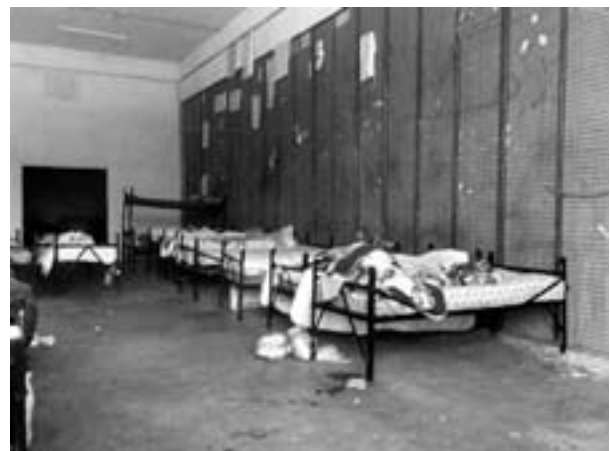
Lesbos: bedroom in the detention centre