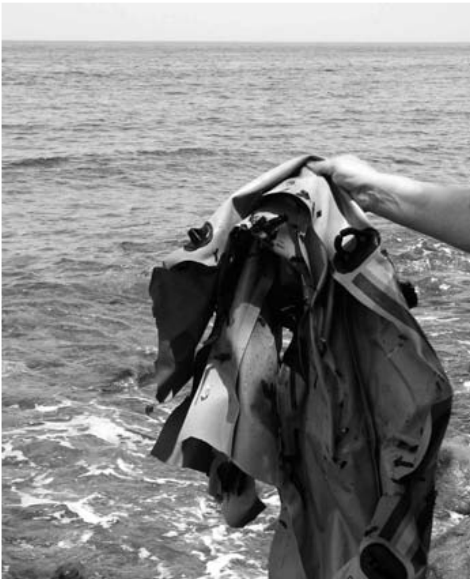
Lesbos: We find a shredded rubber dinghy. What happened, and the fate of the passengers, is an unanswered question.