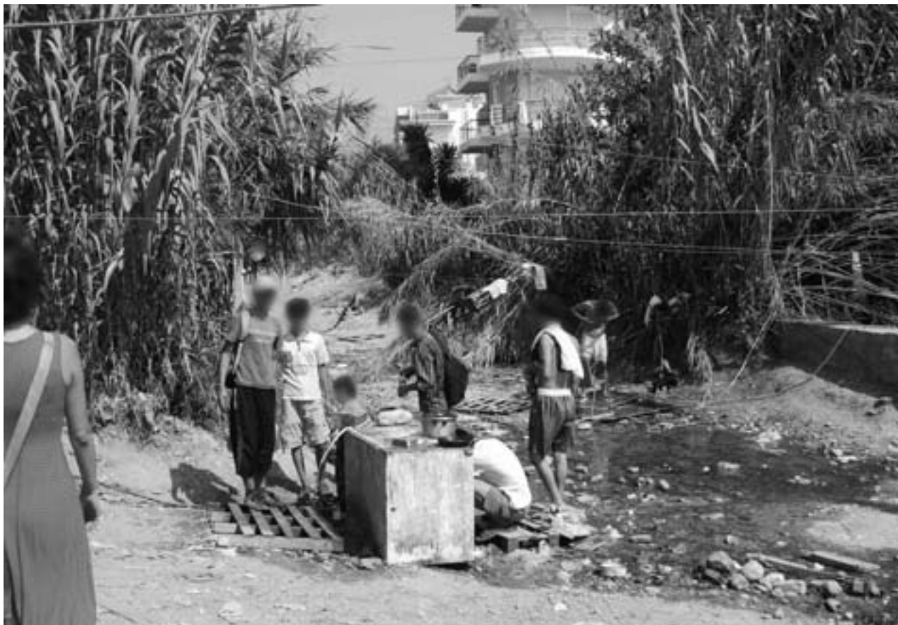
Patras: unsheltered refugees at a river, which serves as the only water supply

The people from the camp were trying to get into the off-limits port area. They wanted to reach Italy on one of the ferries. Sometimes they tried to get on board by clinging to lorries. Again, we heard of abuse by the Greek