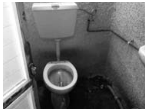
Detention centre Lesbos: At the time of our visit one functioning toilet was provided for 50 detainees.

Our delegation informed the children of their rights in Europe and in Greece, and referred them to an organisation which works for children's rights and the reception of asylum seeking children. Through