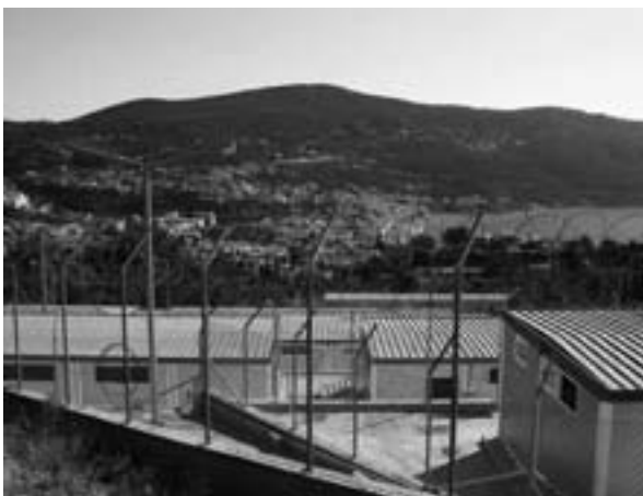
Samos: new detention centre

The detention centre on Samos is to be closed imminently. The new centre in Vathy has been under construction for years, but should be open shortly. The available places for detainees on Samos will quadruple as a result, to around 400 places. The new centre should be an improvement on the current one: there is to be an open area for use by detainees, separate areas for women and children and a functioning sanitary system. The delegation of the European Parliament still has its doubts however: »The flat-roofed ›cabin‹ design of the structures might raise question marks about their suitability given the local climate«. 35 In any case, no improved conditions will disguise the fact that it is a detention centre for people who have committed no criminal offence, and who need protection.