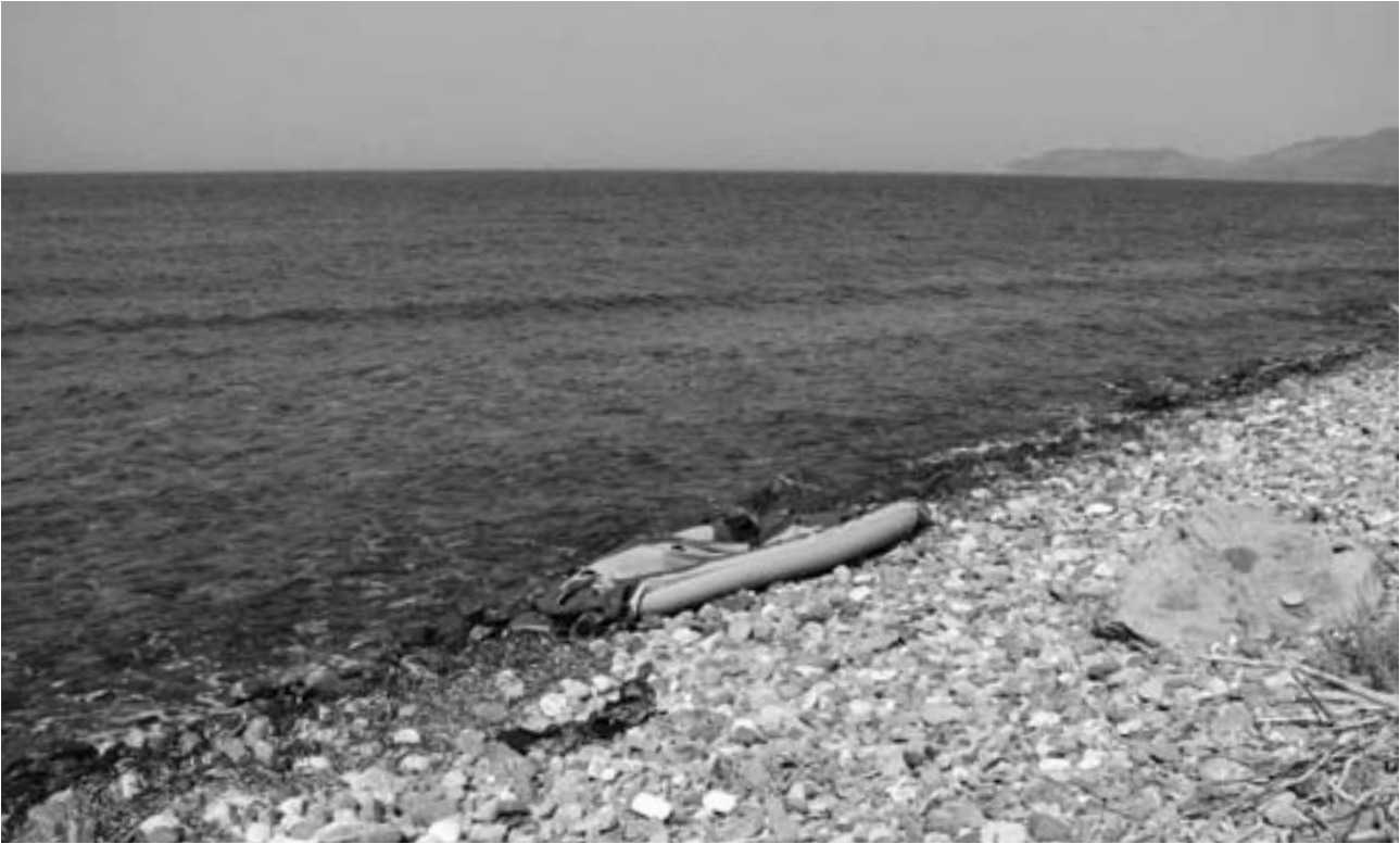
Northcoast of Lesbos: marooned rubber dinghy.