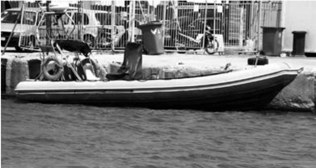
Special boat belonging to the coast guard, without identifying markings or flag.

On 5 August 2007 an incident drew attention to the indiscriminate use of violence by the coast guard, hitting headlines across the country. In the night of 4-5 August 2007, in the strait between Chios and the Turkish coast, a coast guard patrol boat came across a grey dinghy with an outboard motor. The officials later claimed they had repeatedly called on the three men on the suspect dinghy to stop; however the dinghy drove off at full speed and tried to evade capture. In response the patrol boat took up pursuit and opened fire on the dinghy from behind. One of the men on board died from the gunshot wounds.